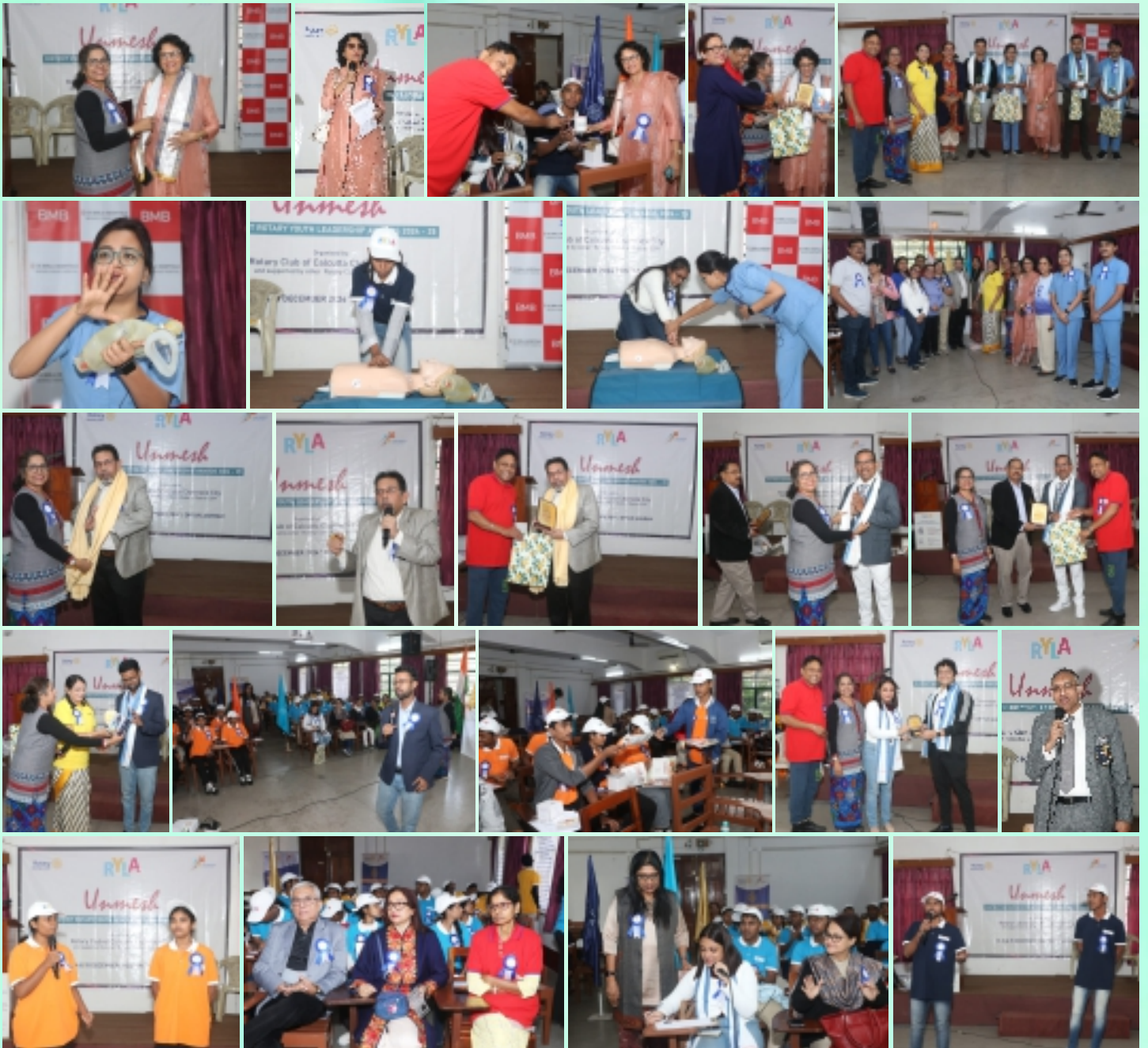
CRP Training & Second Day Plenary Sessions of District RYLA Unmesh 2024-25