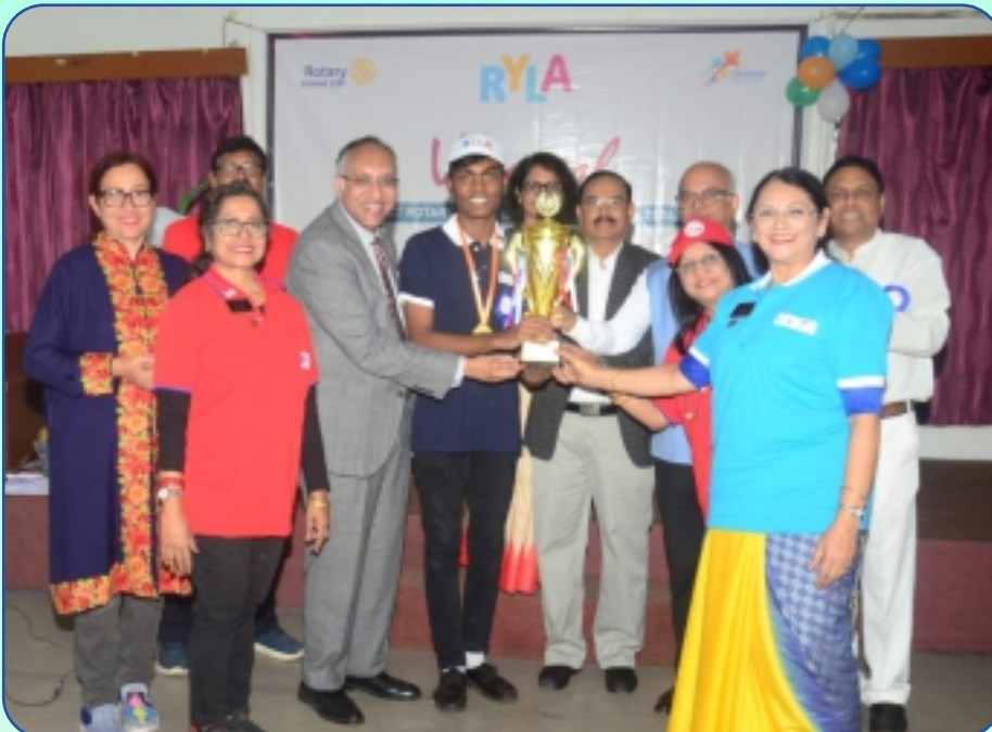
Prize Distribution at District RYLA Unmesh 2024-25