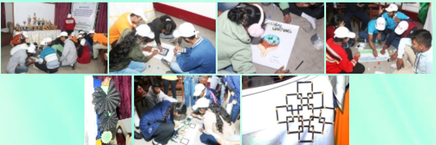
Mind Blogging Art Competition